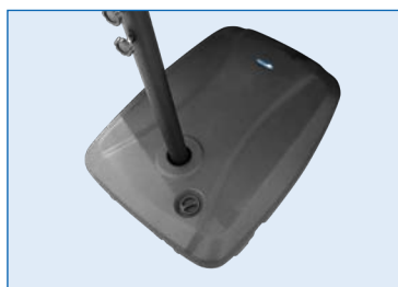
Steel base + ballast