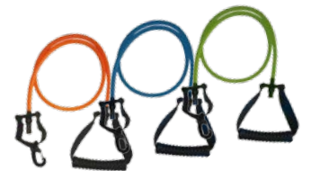
RESISTANCE BANDS 3 LEVELS AVAILABLE