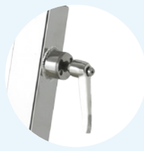
Fast settings Click & Turn