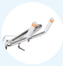
45° sport handlebar